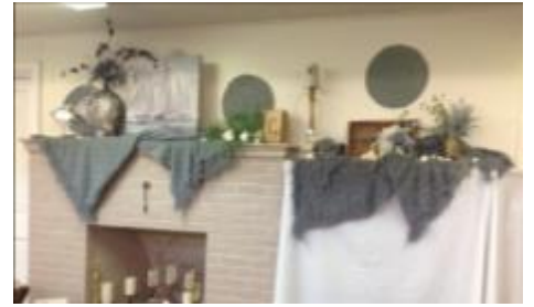
Fun at the Tea!