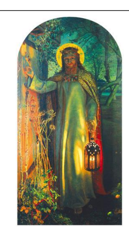
"Your word is a lamp to my feet and a light to my path." Psalm 119: 105 Painting by Holman Hunt

This picture of Jesus with the latch on the inside of the door, reminds us that we must open the door from the inside to allow Jesus to enter our lives and hearts. Lent is a time that we can take to explore how to open our hearts even more to the Love of Jesus.