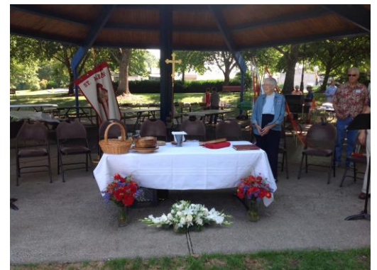
Looking forward to this year's Ecumenical Eucharist in Albany