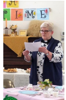
More Tea Fun!