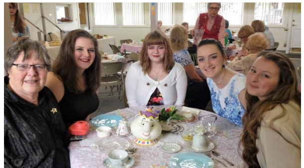
And even more Tea Fun!

Due to busy tax season, our snapshot is postponed until the books are updated. Meanwhile, you can always ask our Senior Warden for details, if you have questions or concerns.