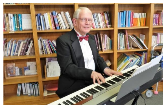
Fun at the Tea!